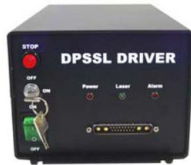
300 (L) ×162(W) ×134(H) mm 3 , 5.2 kg